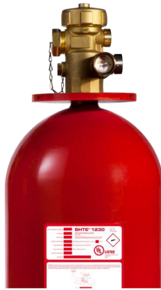
42bar V40 60bar V40